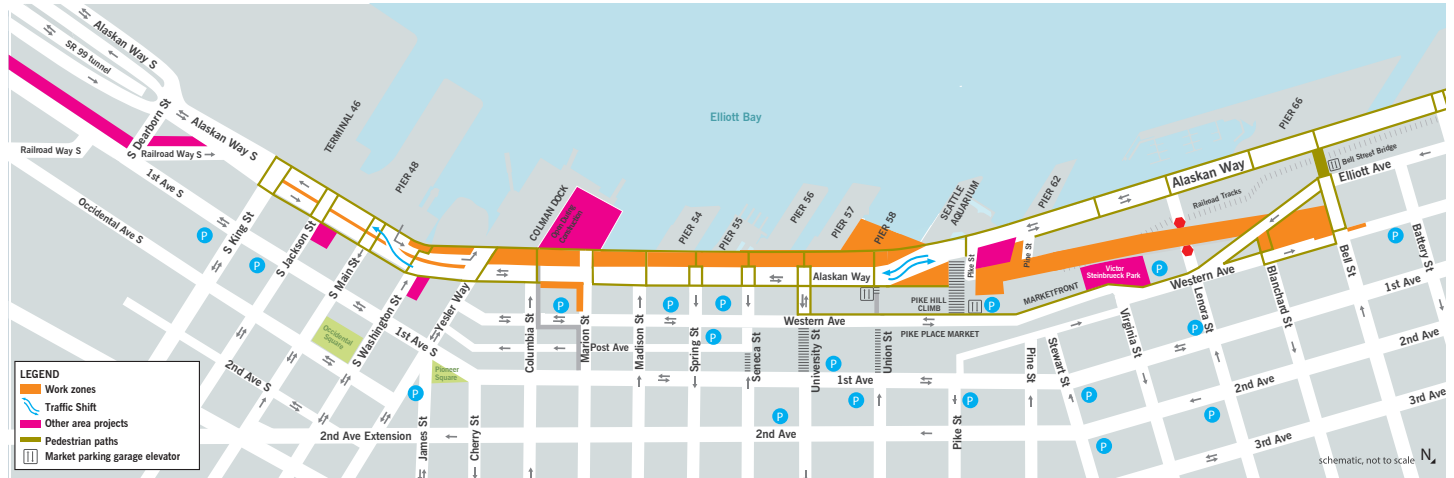
Map of construction work zones.

Construction along Alaskan Way continues to build the promenade between Yesler Way and Pike St. North of Union St, construction on the east side of Alaskan Way continues while we work to complete the elevated roadway connection between the waterfront and Belltown – which includes new sidewalks, bike facilities and landscaping.