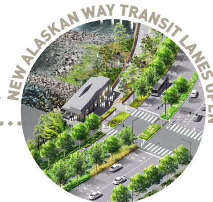
New transit lanes provide vital transit connections from the waterfront to the downtown core