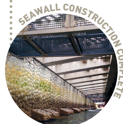
The foundation for the new waterfront