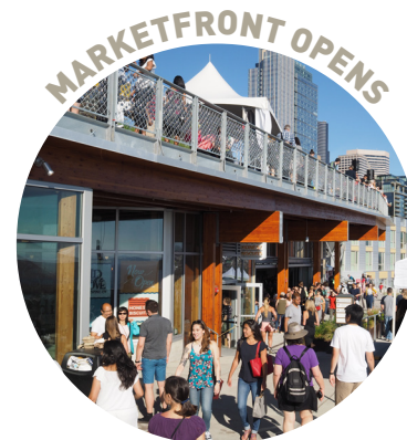
The first piece of the new pedestrian connection between downtown and the waterfront