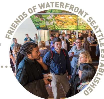
Our nonprofit partner leads programming, fundraising and more