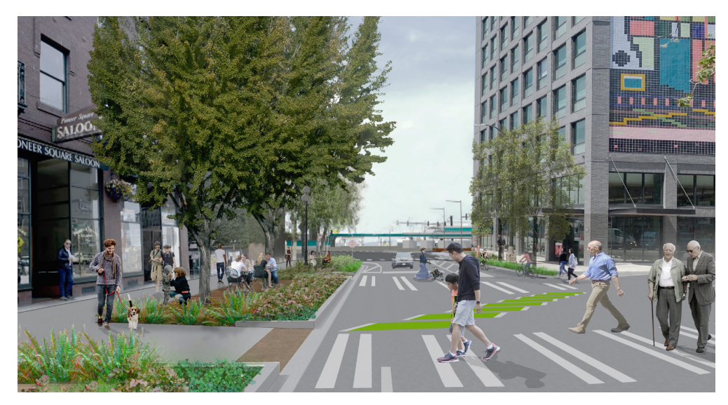
Improvements along Yesler Way include widened sidewalks and increased greenery.

Construction of the Pioneer Square East-West Pedestrian Improvements will continue through the end of 2024. Improvements will be made to portions of S King St between Occidental Ave and Alaskan Way S, S Main and S Washington streets between Alaskan Way S and 2nd Ave S, as well as Yesler Way between Alaskan Way S and 1st Ave S. S Main and S Washington streets will be made one-way for vehicles between Alaskan Way S and 2nd Ave S and include a curbless design to calm traffic. Additional improvements include widening and upgrading sidewalks, adding greenery, including native plantings, and moving vehicles away from areaways. There will be illustrated interpretive panels featuring information about Indigenous practices in the area and ground-level etchings depicting native plants and their usage. In addition, pavement markings will show the original shoreline of the area, prior to settlement.