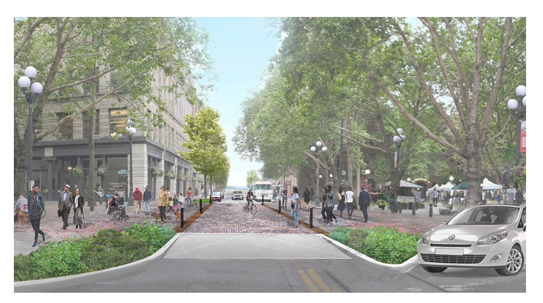
Tabled intersections at Occidental Park will make crossings easier and more accessible for pedestrians

Construction of the Pioneer Square East-West Pedestrian Improvements will continue through the end of 2024. Improvements will be made to portions of S King St between Occidental Ave and Alaskan Way S, S Main and S Washington streets between Alaskan Way S and 2nd Ave S, as well as Yesler Way between Alaskan Way S and 1st Ave S. S Main and S Washington streets will be made one-way for vehicles between Alaskan Way S and 2nd Ave S and include a curbless design to calm traffic. Additional improvements include widening and upgrading sidewalks, adding greenery, including native plantings, and moving vehicles away from areaways. There will be illustrated interpretive panels featuring information about Indigenous practices in the area and ground-level etchings depicting native plants and their usage. In addition, pavement markings will show the original shoreline of the area, prior to settlement.