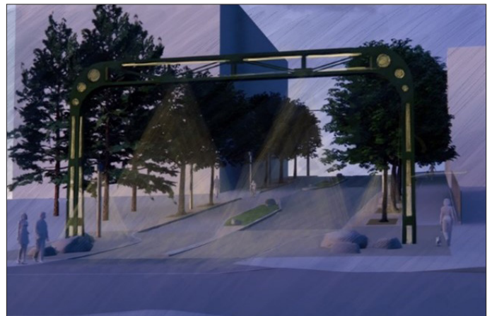
Kaabadda astaanta Alaskan Way Viaduct ayaa habeenkii la iftiimin doonaa waxaana loo adeegsan doonaa taallo ama bartilmaameed, oo booqdeyaasha loogu soo dhawaynayo xaafadda la wanaajiyey iyo sidoo kale Belltown.