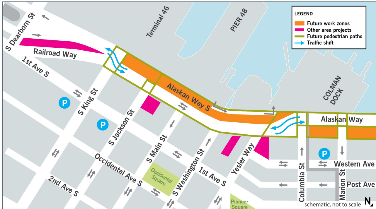
Map of work zones.

As early as December 11, Alaskan Way traffic will shift to the east, in the footprint of the former viaduct, onto the newly rebuilt roadway between S King and Columbia streets. The construction on Alaskan Way will shift to the west between S King and Columbia streets to continue building the new Alaskan Way. North of Columbia St, construction will remain in our current work area on the east side of Alaskan Way.