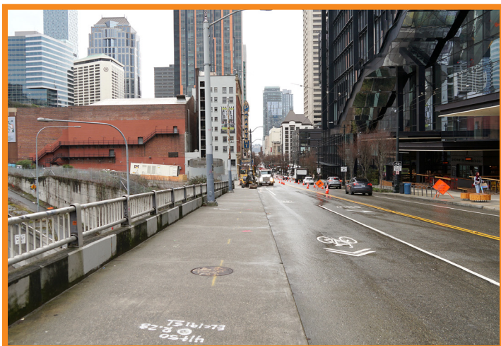
February 2024 photo of Pine St at Boren Ave looking west.