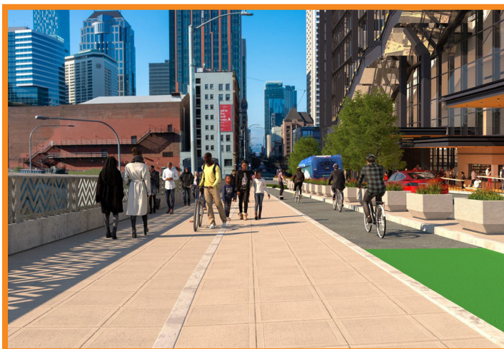
Rendering of expanded sidewalk and protected bicycle lane on the I-5 bridge overpass on Pine St, east of the 9th Ave intersection, looking west when completed.