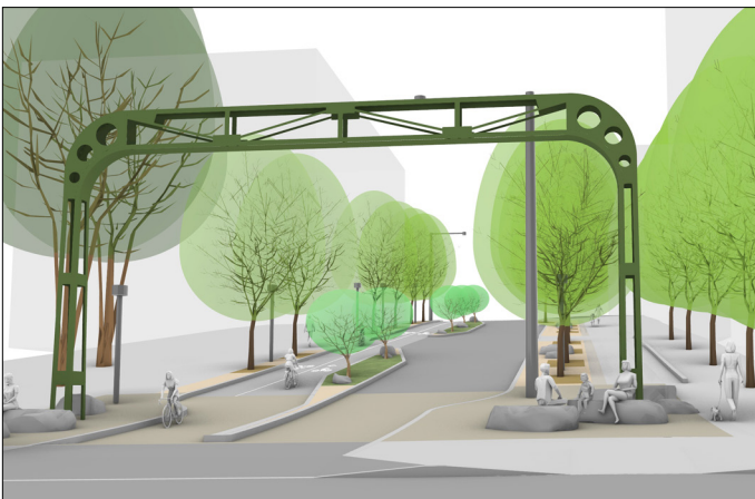
Planned view of Bell St, looking east at the intersection of Bell St and Western Ave.

Improvements prioritize pedestrian and bicyclist safety, access and mobility. The project will add a two-way protected bike lane, widen sidewalks, add seating with views of Elliott Bay and the Seattle Waterfront and increase greenery along the two-block corridor. The project also incorporates the historic Alaskan Way Viaduct sign bridge, which will be illuminated and serve as a gateway to the Belltown neighborhood.