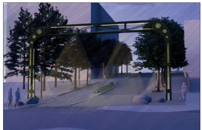
The Alaskan Way Viaduct sign bridge will be illuminated at night and will serve as a landmark, welcoming visitors to the improved area and Belltown alike.