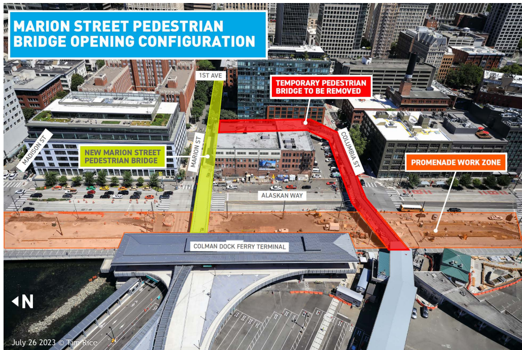
Graphic illustrating the new Marion Street Pedestrian Bridge and the temporary pedestrian bridge to be removed starting week of November 6.