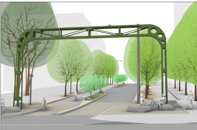
Muuqaalka qorshaysan ee dariiqa Bell St, marka bari laga eego isgoyska dariiqyada Bell St iyo Western Ave.

Hawlaha wanaajinta waxaa mudnaan lagu siinayaa badbaadada, gelitaanka iyo dhaqdhaqaaqa dadka lugaynaya iyo baaskiil wadeyaasha. Mashruucu waxuu meesha ku soo dari doonaa jid baaskiil oo isku gudba oo dhawran, waxuu ballaarin doonaa geesyada waddada ee lug lagu maro, waxuu kordhin doonaa kuraasta lagu daawan karo gacanka Elliott Bay iyo qarka biyaha ee Seattle Waterfront waxuuna kordhin doonaa dhirta ku taxan wadiiqada labada sakadood. Mashruuca waxaa weliba qayb ka ah kaabadda astaanta Alaskan Way Viaduct ee taariikhiga ah, kaasoo la iftiimin doono oo loo adeegsan doono marin laga galo xaafadda Belltown.