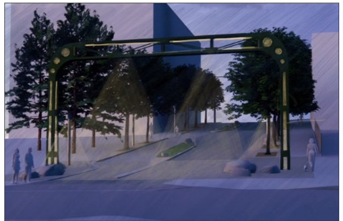
Kaabadda astaanta Alaskan Way Viaduct ayaa habeenkii la iftiimin doonaa waxaana loo adeegsan doonaa taallo ama bartilmaameed, oo booqdeyaasha loogu soo dhawaynayo xaafadda la wanaajiyey iyo sidoo kale Belltown.