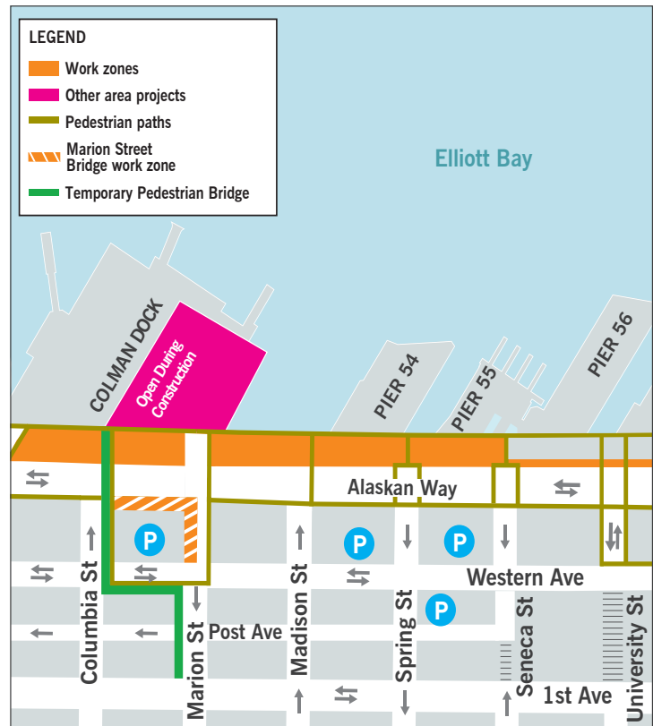
Map of current work zones and future Marion Street Bridge work zone.