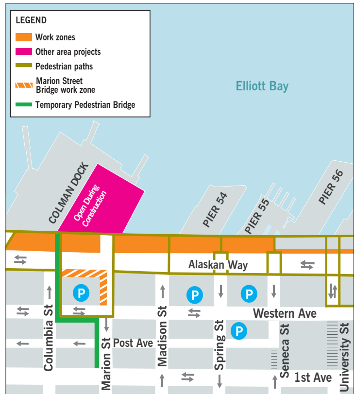
Map of current work zones and future Marion Street Bridge work zone.