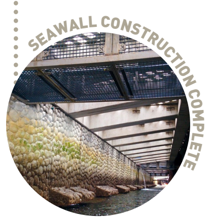
The foundation for the new waterfront