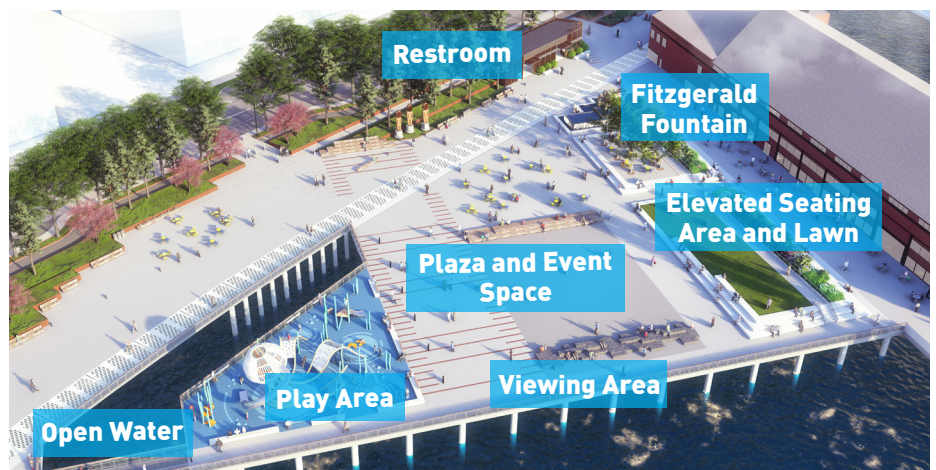
The above design features promote areas for play and relaxation.