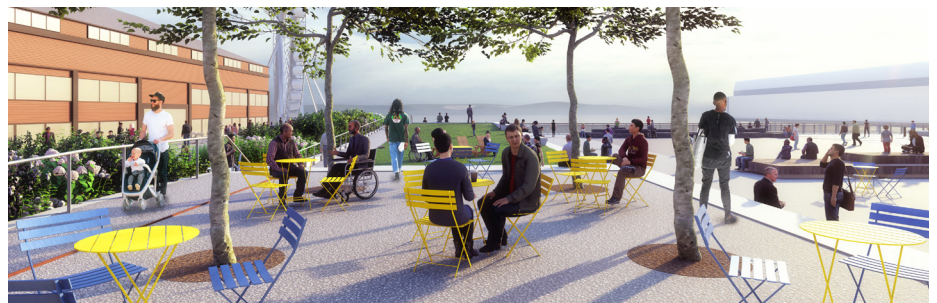
The new pier includes an elevated seating area and lawn to enjoy scenic views.