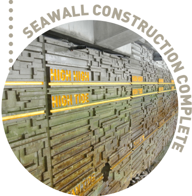
The foundation for the new waterfront