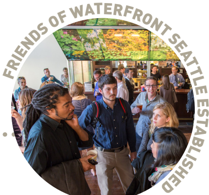
Our nonprofit partner leads programming, fundraising and more