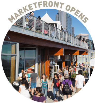
The first piece of the new pedestrian connection between downtown and the waterfront