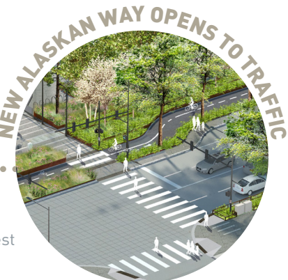
The new surface street will provide clear pedestrian crossings and signalized intersections