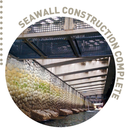
The foundation for the new waterfront