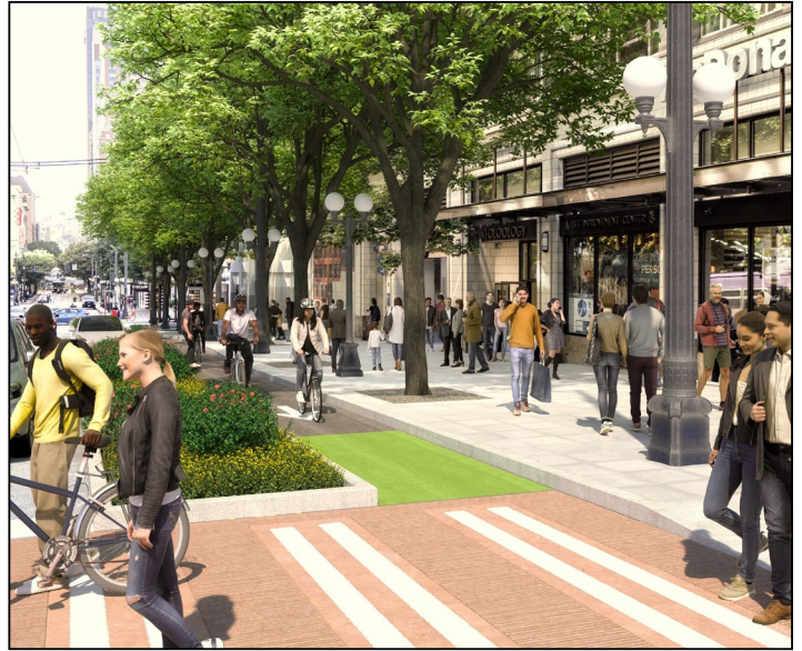
Artist rendering of future improvements at Pine St and 3rd Ave.