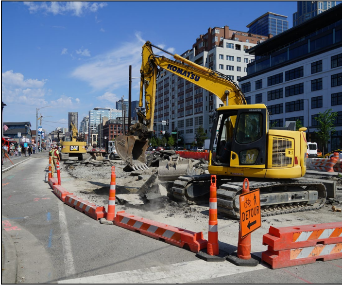
A photo of pavement removal, a necessary stage of work to construct improvements.

The new design of Pike and Pine streets will provide a more pleasant pedestrian and bicycling experience. The design features a protected bike lane, consistent quality of sidewalk paving, more visible crosswalks, wider sidewalks, greenery and landscaping and signature crosswalks from 1st Ave to Bellevue Ave.