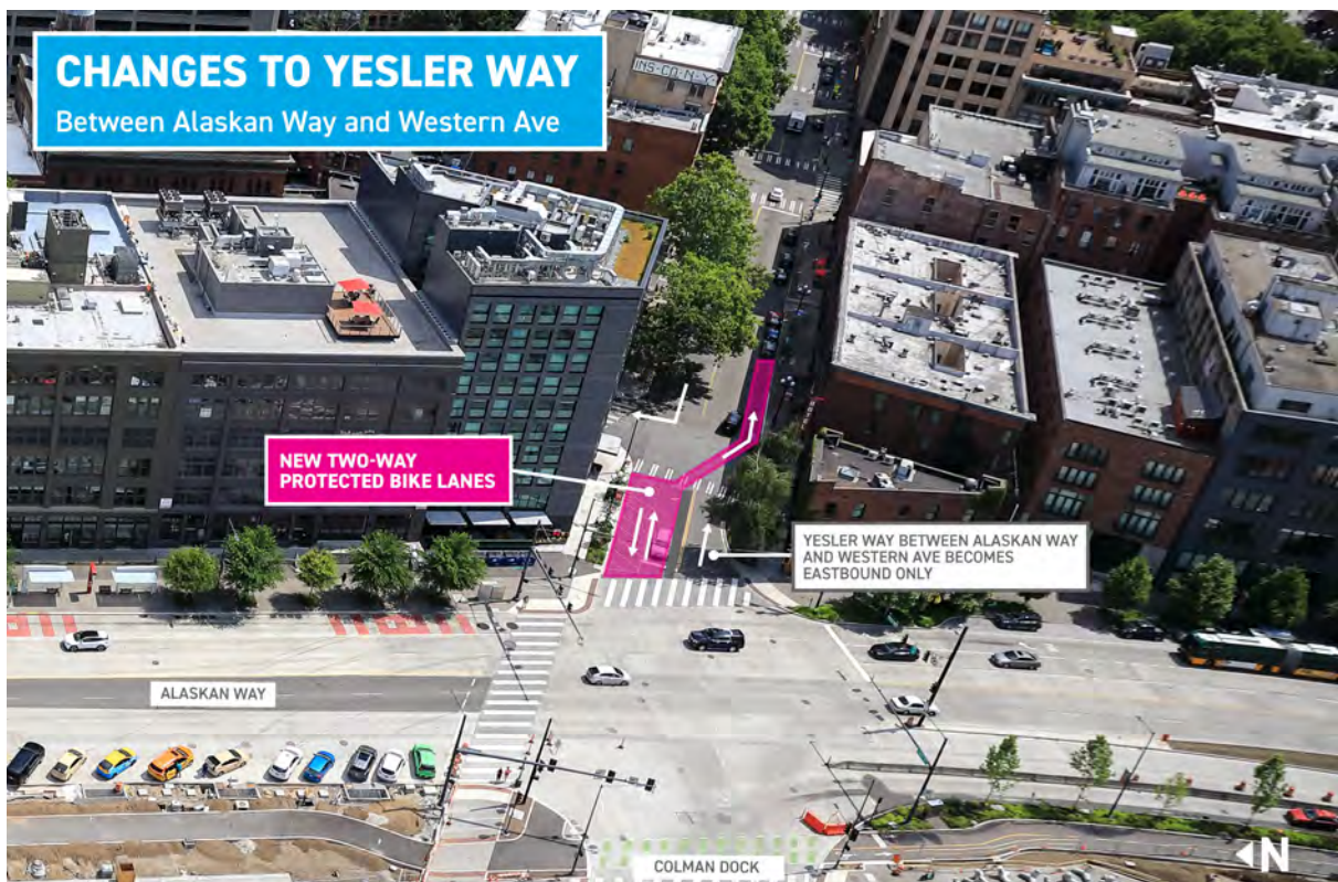
New lane configuration on Yesler Way between Alaskan Way and Western Ave.