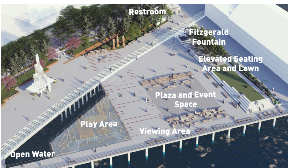
The above design features promote areas for play and relaxation.