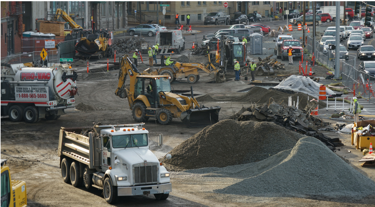
Example of work zone during mobilization and excavation activities.